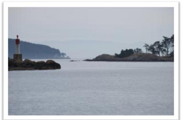
POET'S COVE, BEDWELL HARBOR BC

▶ Cruising Blog: cruisingwithttpcy open for great conversations regarding the Summer Cruise to the Canadian Gulf Islands and Desolation Sound.